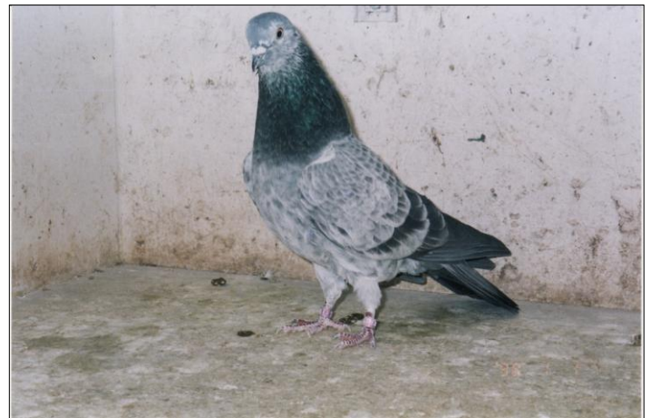
loft in ways I could not imagine – fantastic breeder.