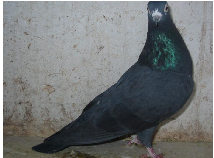
This 183 OTU 97 hen was one of the hens I received from Oskar in 1997 that elevated the performance of the

The bronze hen below and the black cock that you see here are 2 of the 5 birds that I bought from Oskar as youngsters back in 1991. This black cock is closely related to the 4265 foundation cock that Oskar started with. The 4265-1973 foundation cock looked very much like this bird you see here.