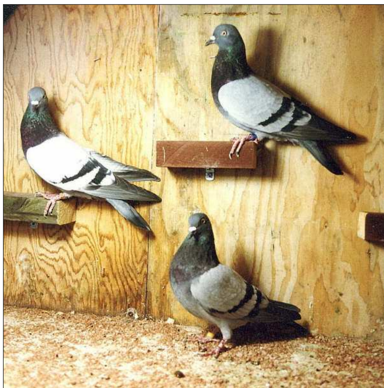
Kemo's kit of 3 blue cocks that broke the 35-year-old record previously held by George Vertolli.