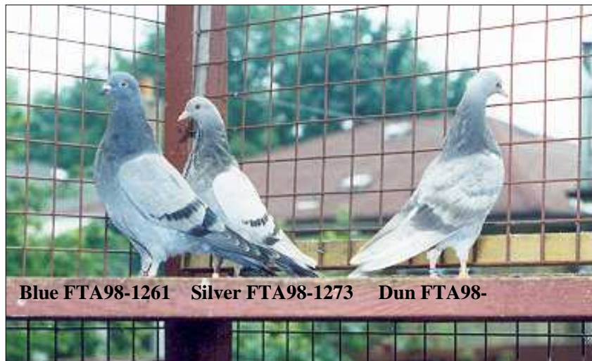
Blue FTA98-1261 Silver FTA98-1273 Dun FTA98-